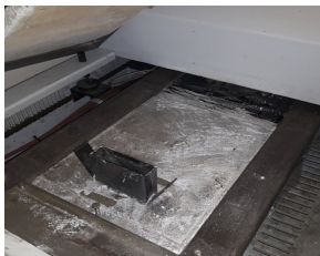
Wave solder pot with dross

5744 must be used on a still solder pot surface. All solder wave pumping and agitation action must be turned off. The pot temperature should be controlled to 232 to 260 °C (450 to 500 °F). Cover the solder surface with 5744 by sprinkling the powder on the pot in a thin covering layer, no greater than 6.4 mm (0.25 in) thick. Slowly mix the salt with the surface of the solder with a metallic solder ladle or a metal spatula. Allow the salt 10 seconds after mixing to convert the dross back to solder. Move any dross on the pot into the salt covered surface to convert the dross to metal. When done, remove the dross recovery salt and other dirt residues with a metallic solder ladle or a metal spatula. All of the 5744 should be removed from the solder surface. 5744 is intended to be used as received.